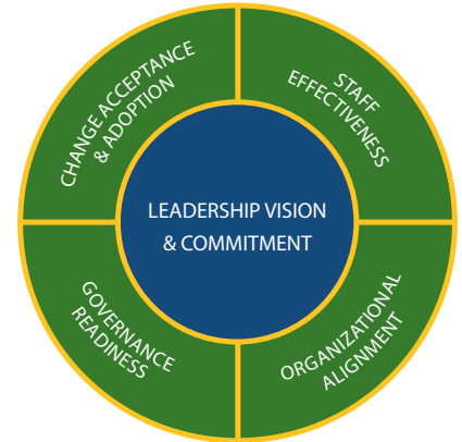
Drivers for Successful Change

Good news: TPI can help you accelerate and sustain the changes needed to fully achieve your intended benefits of moving to a new sourcing model.